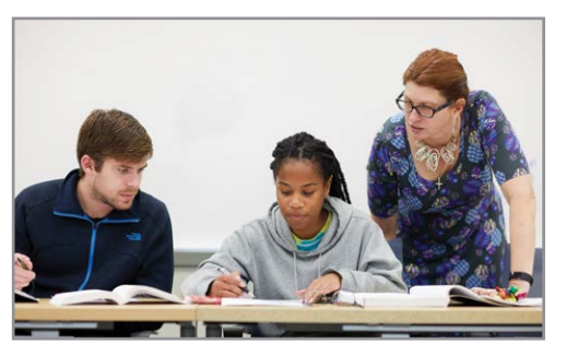
Support UMW students and programs.